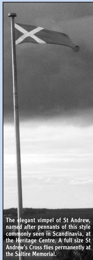
The elegant vimpel of St Andrew, named after pennants of this style commonly seen in Scandinavia, at the Heritage Centre. A full size St Andrew's Cross flies permanently at the Saltire Memorial.

The many existing Friends of the Flag Trust have been magnificent with their support, which is mainly by way of annual subscriptions of £10 (minimum) and by donations. However, the Trust needs to recruit more Friends, and a target of an additional 100 has been set. So, if you know anyone who might be prepared to add his or her support, please let us know and a Friends application form will be sent off!