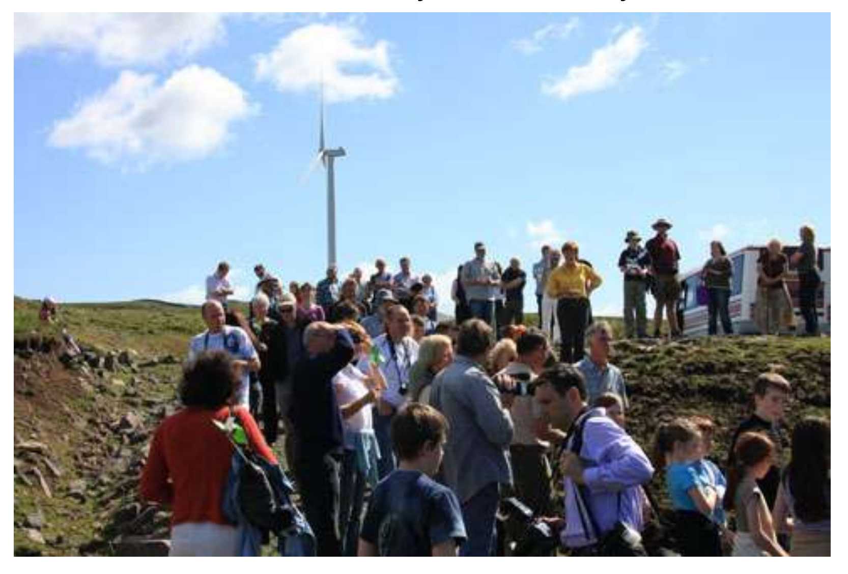
Energy is Power and Resilience