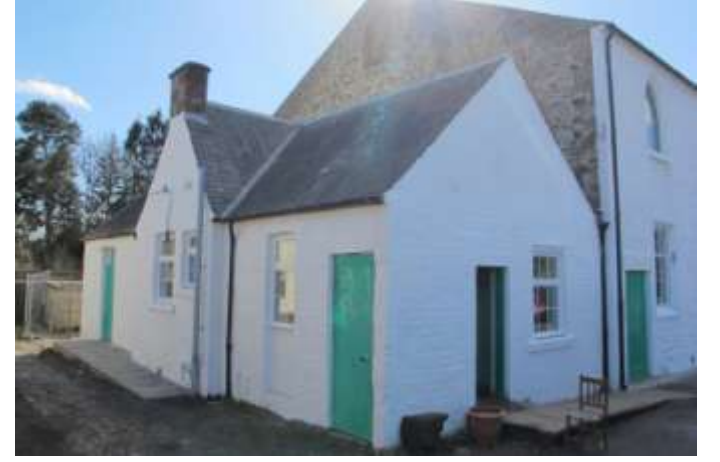
Site Renovation April 2010 – April 2011