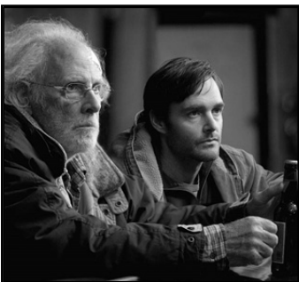
Nebraska (15) 2013, US, 1hr 55mins

A cantankerous old drunk takes a road trip to claim a million-dollar sweepstake prize that no one believes he's won.