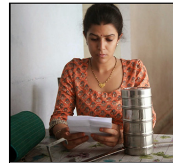
The Lunch Box (PG) 2014, India, 1hr 44mins (Subtitles)

Two lonely hearts connect when the lunch box a woman has prepared for her husband in an attempt to spice up their marriage goes astray.