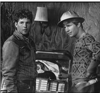
The Last Picture Show (15) 1971, US, 2hr 5mins

A portrait of small-town Texas. A coming of age story. A reckoning of a country that has lost its way. A classic of 1970s cinema.