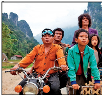
The Rocket (12) 2014, Laos, 1hr 36mins (Subtitles)

In defiance of the belief that he is cursed to bring bad luck, a boy leads his family through war ravaged Laos to find a new home.