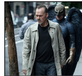
Birdman (15) 2014, US, 1hr 59mins

An actor - famous for playing an iconic superhero - struggles to mount a Broadway play while trying to recover his family, his career, and himself.