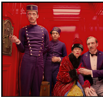
The Grand Budapest Hotel (15) 2014, US, 1hr 39mins

A tale of art theft and the battle for a vast family fortune plays out against the back-drop of a dramatically changing Continent between the wars.