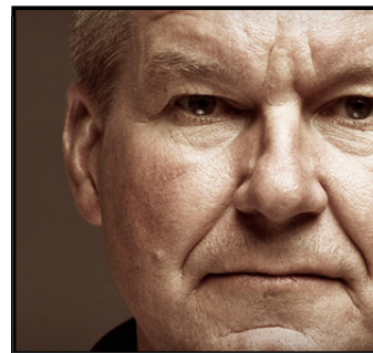
The Overnighters (PG13) 2014, US, 1hr 42mins (Documentary)

A pastor allows down-and-out workers to sleep at his church leading to profound and unexpected consequences.