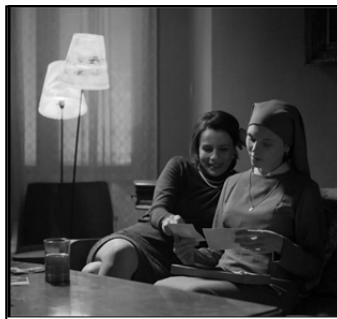
Ida (12A) 2013, Poland, 1hr 20mins (Subtitles)

A novitiate nun in 1960s Poland, on the verge of taking her vows, discovers a dark family secret dating from the terrible years of the Nazi occupation.