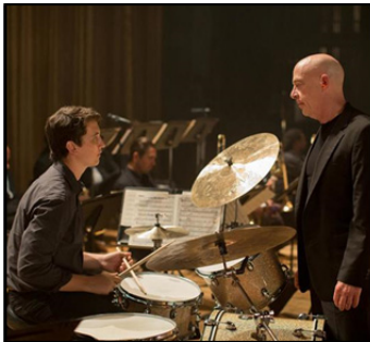
Whiplash (15) 2015, US, 1hr 47mins

A musician's pursuit of perfection spirals into obsession as his ruthless teacher pushes him to the brink of both his ability and his sanity.